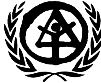
United Nations Commission on Human Settlements