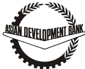
Asian Development Bank